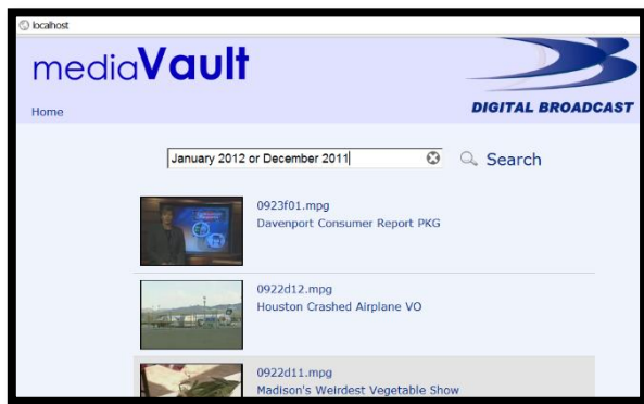
Search Local MediaVault

DBI Archive Sharing unites your stations into one cohesive group and creates an immense archive readily available to all.